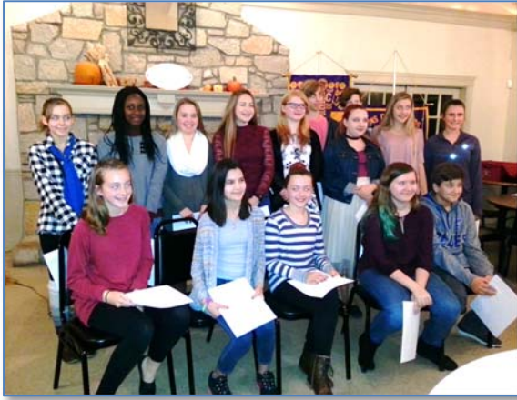
2016 Peace Poster Winners