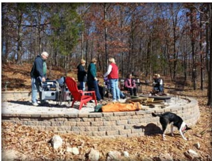
Carnival Worker's Party 2014