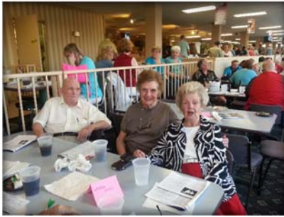
Night at the Races 2013