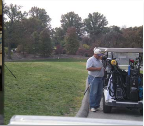
Golf Tournament 2011