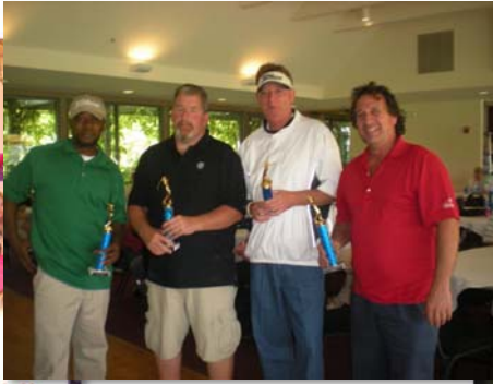
2 Golf Tournament 2011