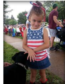
What a Cutie