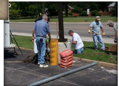
New BBQ Electricals