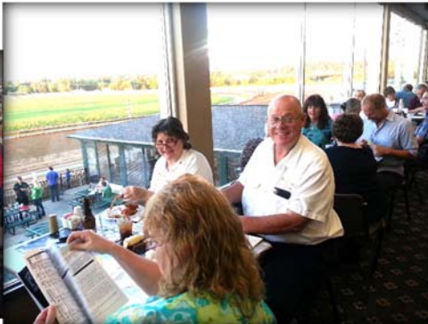
Night at the Races 2013