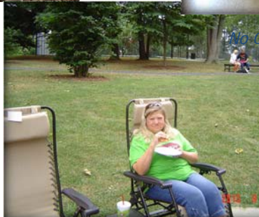
Carnival Worker's Picnic 2013