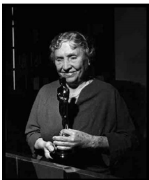
Helen Keller Holding Her Oscar for the Movie "The Hellen Keller Story" Circa 1954