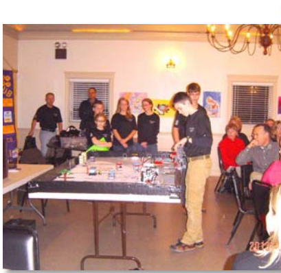
3 First Lego League Demonstration 2013