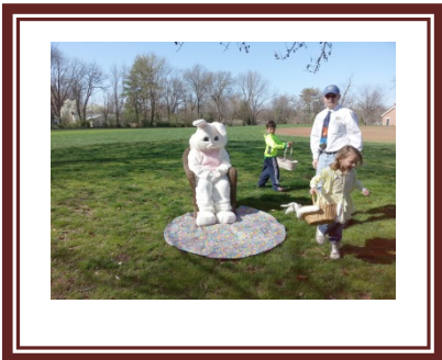
Webster Groves Lions Easter Egg Hunt April 4, 2015 A total of 186 "hunters" participated. A great time was had by all. Many thanks to the volunteers who "nested" 2,000 eggs.