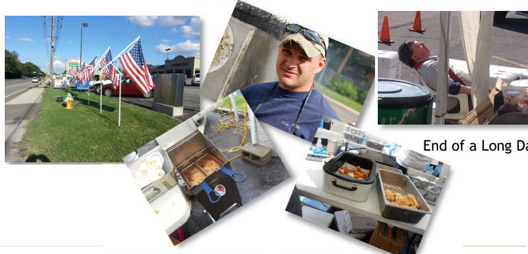
End of a Long Day!!

The April BBQ was a great success. The weather cooperated, 84 degs Friday with a little rain in the afternoon. Saturday was sunny all day but windy. Again, the fried cod was a popular item. May BBQ, weather was great, business was great. It seemed like we had a continuous line of customers from late morning until early evening. Many thanks to the Lions and volunteers who helped.