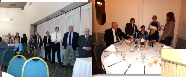
Officer Installation Dinner 2017